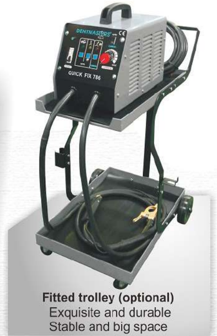
Fitted trolley (optional) Exquisite and durable Stable and big space