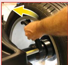
Rim run-out measurement with internal data gauge.