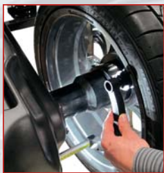
Automatic storage of distance and diameter.

ELECTRONIC WHEEL BALANCERS WITH MICROPROCESSOR