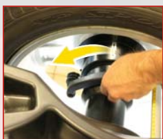
Quick selection with internal data gauge.