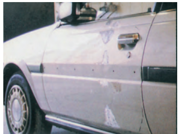
The distortion area can be reduced drastically by only repairing the plastic distortion.