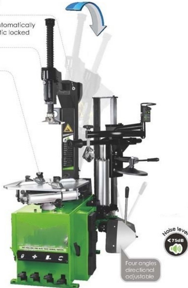
Full-automatic pneumatic tilting column